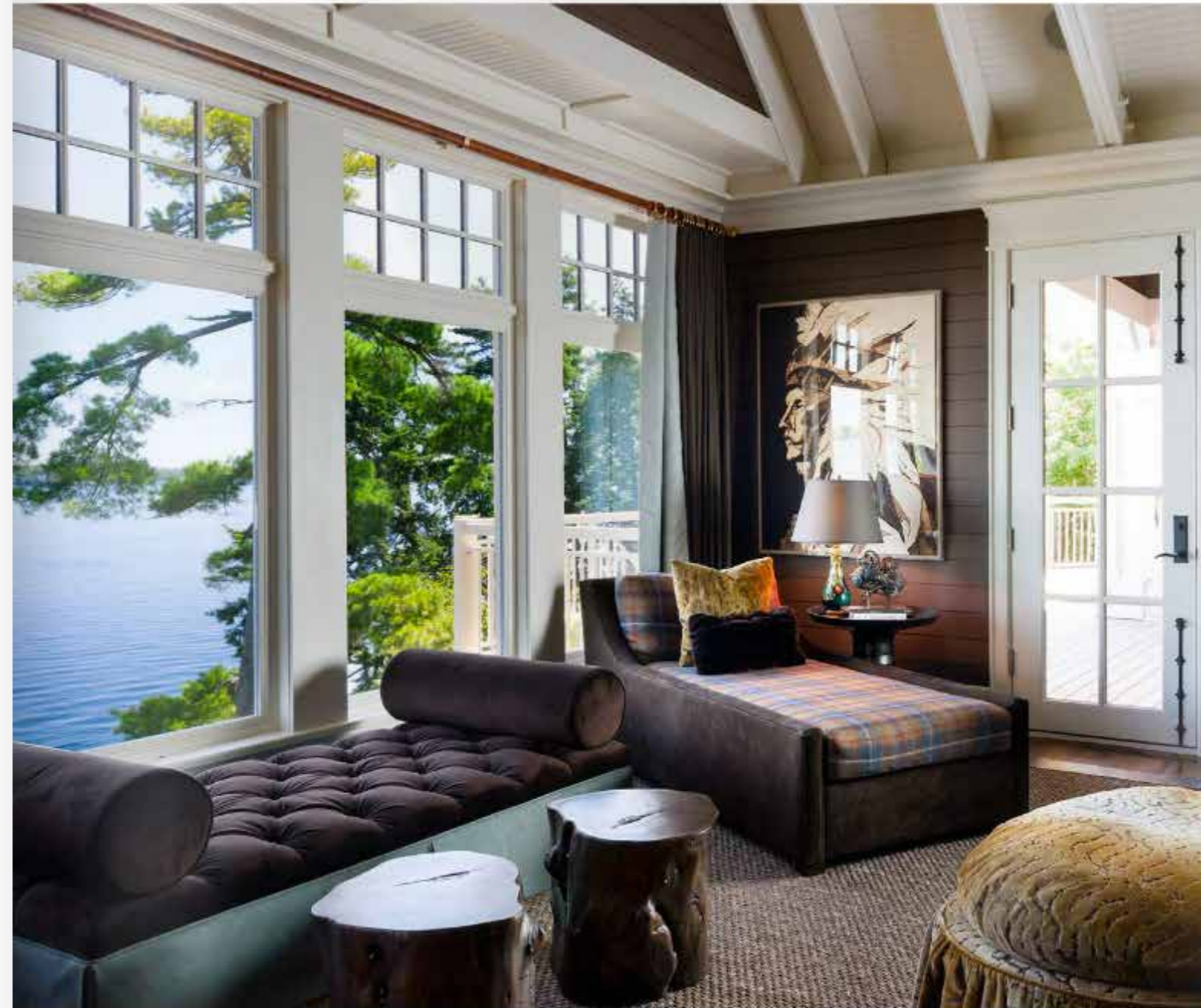
Morris takes full advantage of the architectural elements and the striking views to create a space perfect for relaxation.