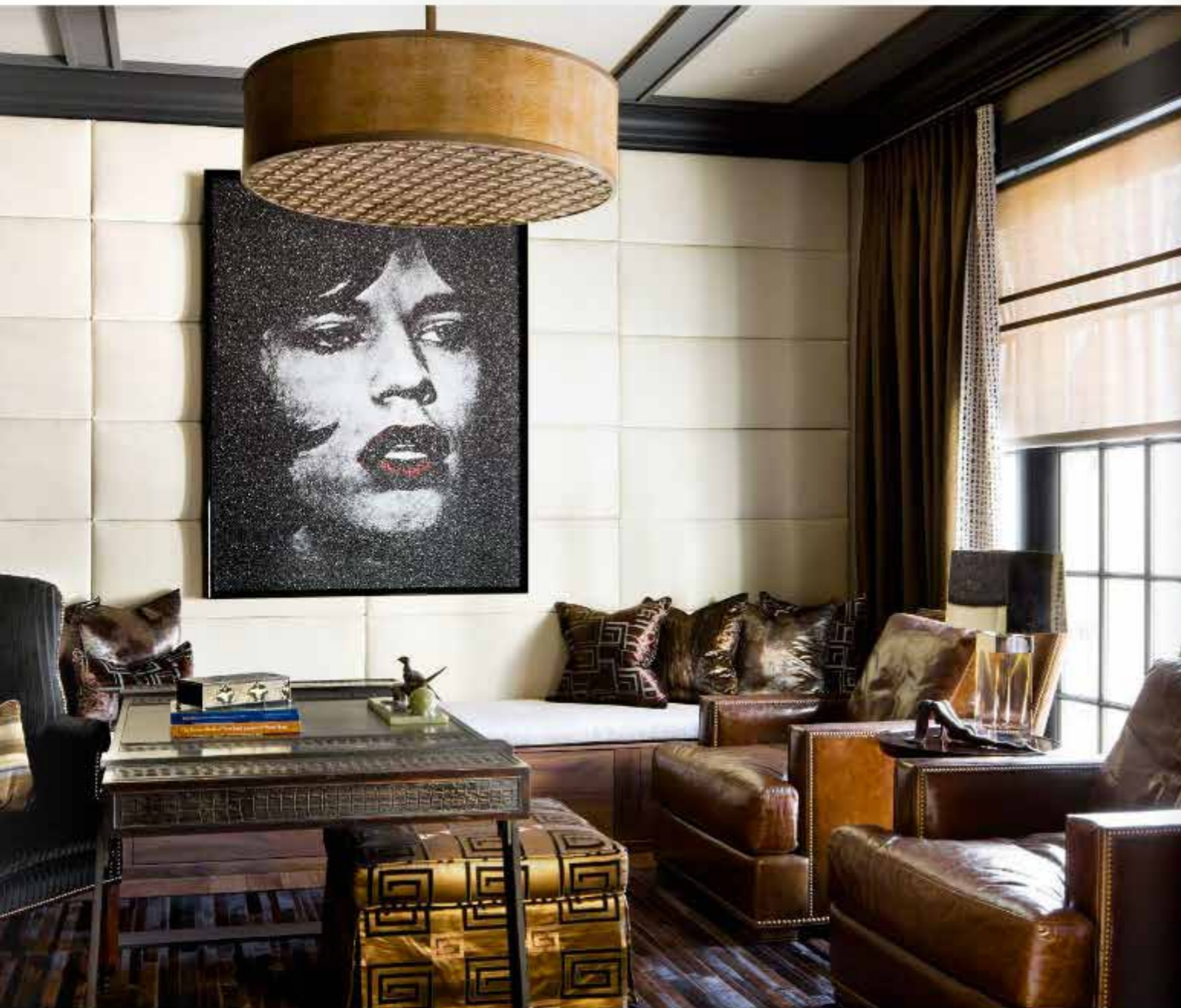
Handsome leather, substantial mid-century elements and pop culture are perfectly fused in this ornate and richly warm lounge.