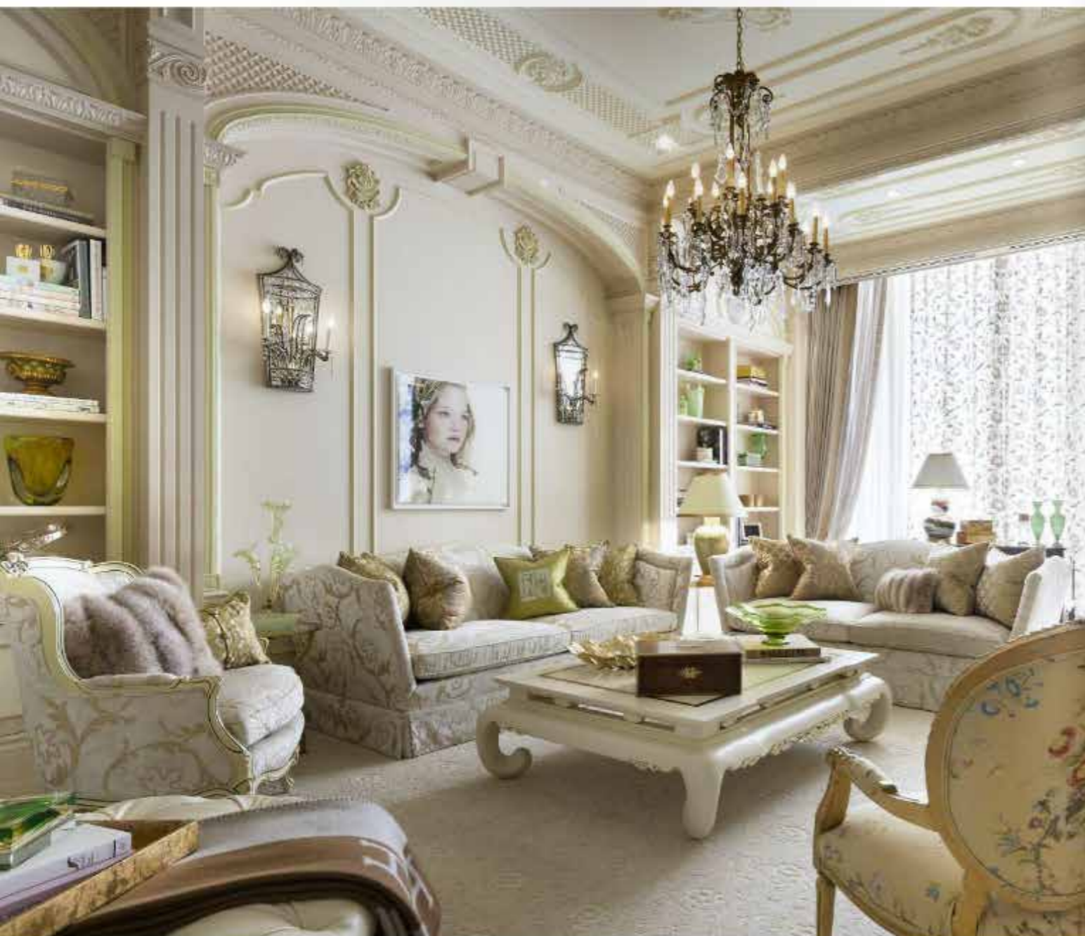
Highly stylized classics in furniture and draperies are enhanced by the crystal chandeliers and gilded accents in this European-inspired living area.